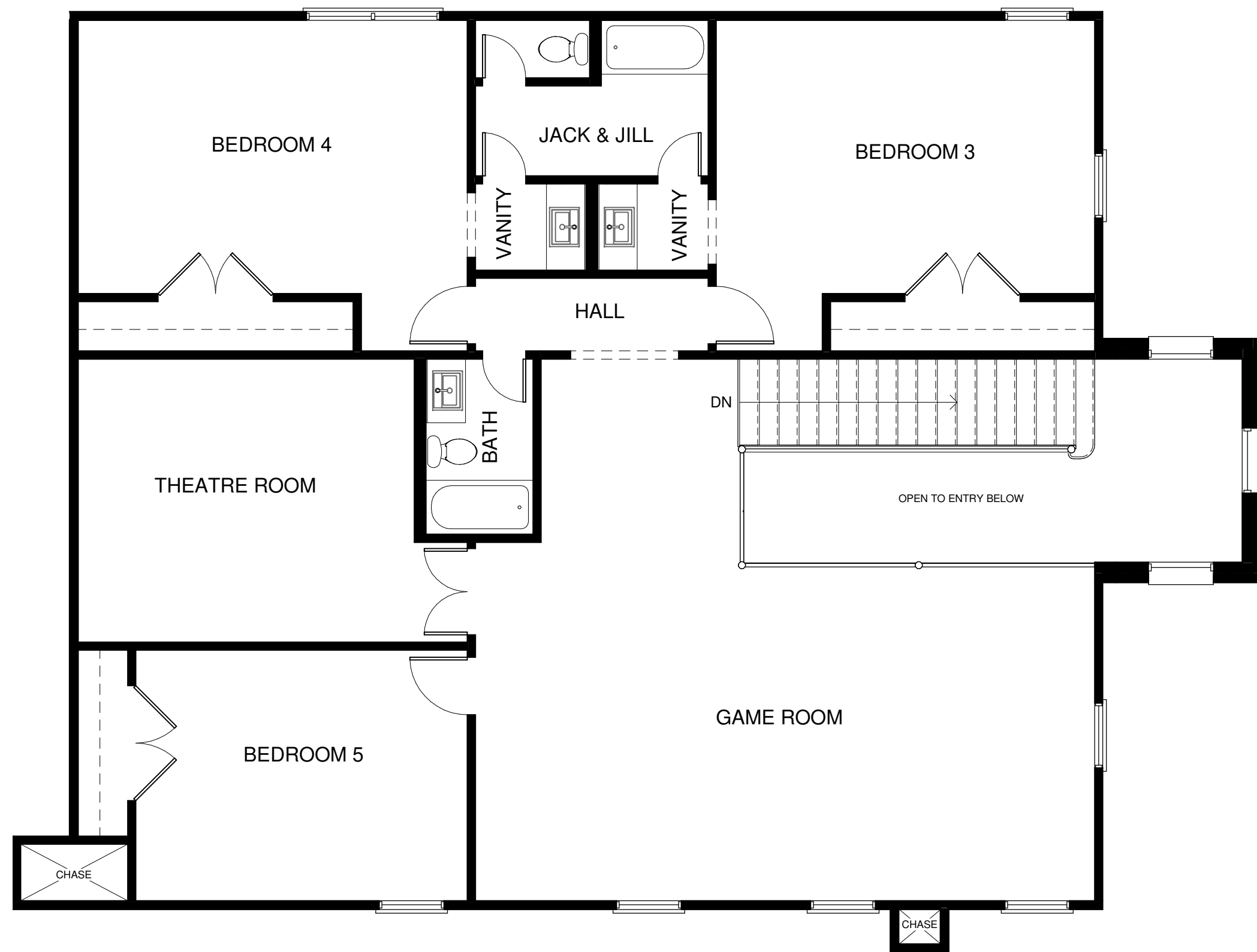
2 FLOOR PLAN 2ND SALES 3/16" = 1'-0"