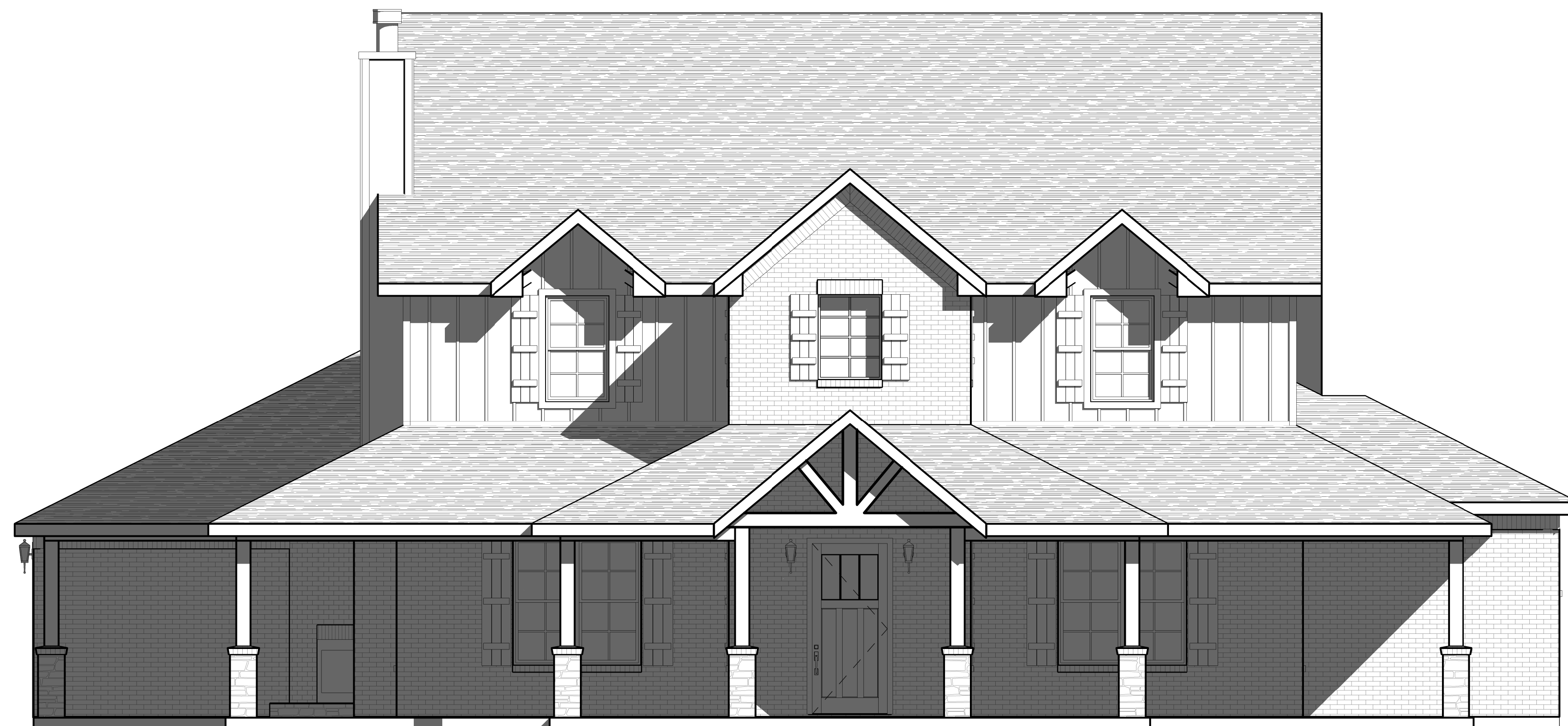
① ELEVATION - FRONT SALES 1/4" = 1'-0"